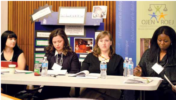
PANEL PRESENTATION AT THE JUSTICE EDUCATION SYMPOSIUM

An Aboriginal Jury Trial Program was developed and piloted over four days in April at the Dennis Franklin Cromarty High School in Thunder Bay. The program introduced students to the jury trial process. A new mock trial scenario involving aboriginal witnesses, a jury charge and sentencing information were developed for OJEN by a law student from the University of Toronto who was on a clinical placement with the David Asper Center for Constitutional Rights. Justice sector volunteers staged the mock trial in the classroom while students acted as jury members, arriving at a verdict and deciding on a sentence. Later they conducted a sentencing circle. The sentencing comparison built understanding of the conventional versus restorative sentencing process.