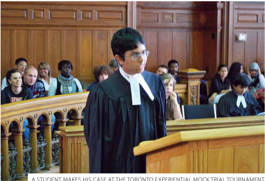
A STUDENT MAKES HIS CASE AT THE TORONTO EXPERIENTIAL MOCK TRIAL TOURNAMENT