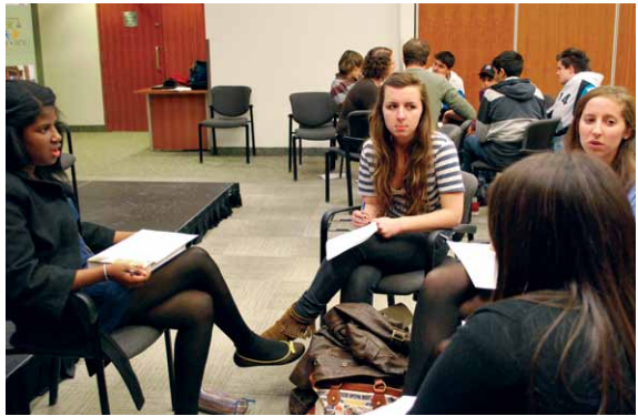
RIGHT: GRADE 10 CIVICS STUDENTS PARTICIPATE IN AN ACTIVE CITIZEN'S WORKSHOP