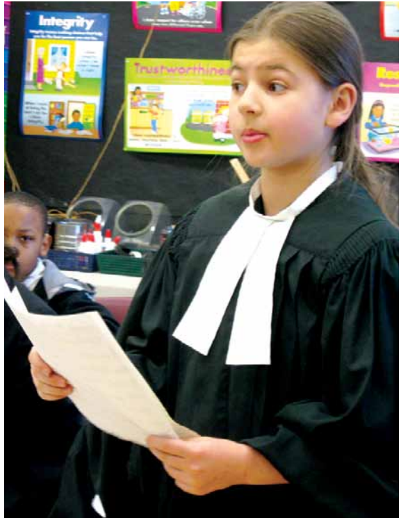
ABOVE: STUDENTS PREPARING FOR THE TORONTO EXPERIENTIAL MOCK TRIAL TOURNAMENT