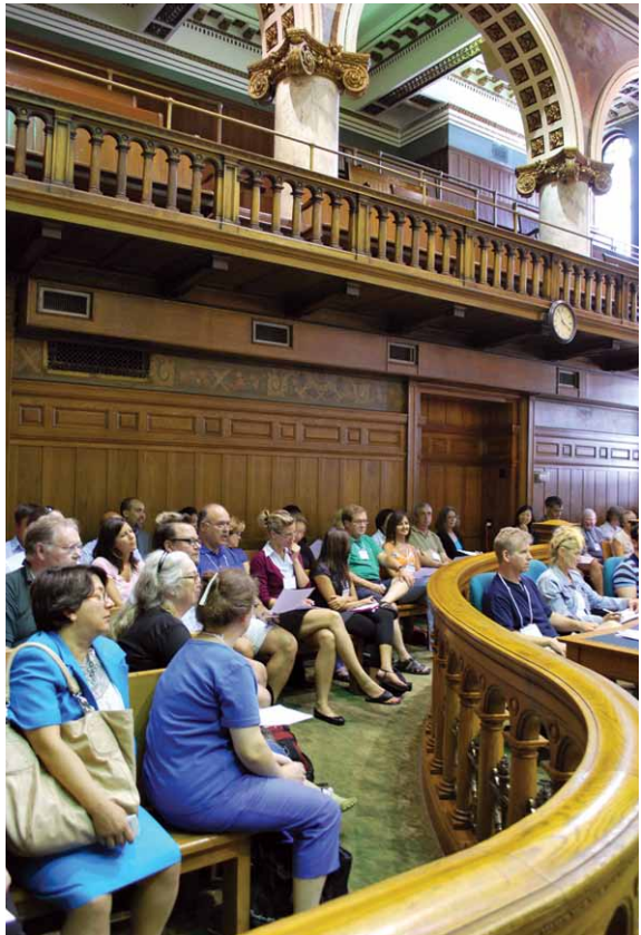
TEACHERS ATTEND OLD CITY HALL COURTHOUSE DURING THE SUMMER LAW INSTITUTE