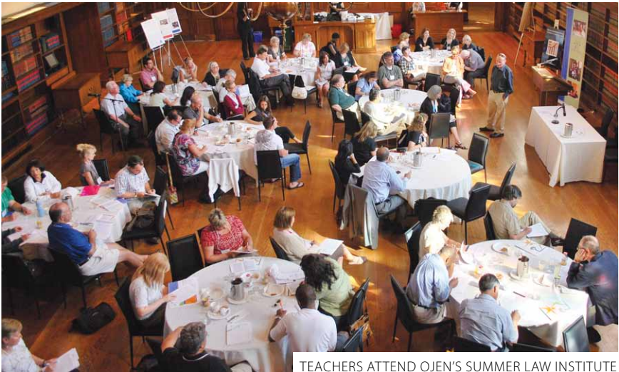
TEACHERS ATTEND OJEN'S SUMMER LAW INSTITUTE

"Justice Education and Constitutionalism: OJEN's role in promoting understanding of democracy."