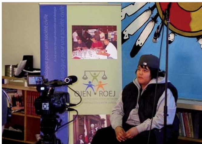
Aboriginal Student from Thunder Bay Discusses What He's Learned by Sitting on a Jury