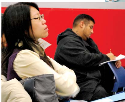
Community Youth Workers and Student Success Teachers Attend Navigating the Justice System Workshops