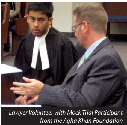
Lawyer Volunteer with Mock Trial Participant from the Agha Khan Foundation

OJEN responded to an invitation from the Ismaili Council of Ontario to provide a Mock Trial program for a group of Afghan refugee youth in June 2010. Twenty girls and sixteen boys worked with lawyer coaches to prepare for a family mock trial and a mock bail hearing. The program culminated with youth staging their mock hearings for each other and their families at the Brampton Court House. The Council was referred to OJEN by the Afghan Women's Association who had participated in the Mock Trial program the year before. The experience fosters self confidence and advocacy skills while at the same time helping the youth and their families develop confidence in Canada's system of rights protection.