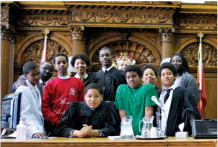
TCH Youth in OJEN's Mock Trial Program