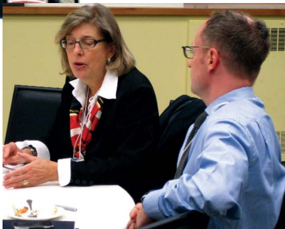
OJEN Network Members Participate in Group Discussions