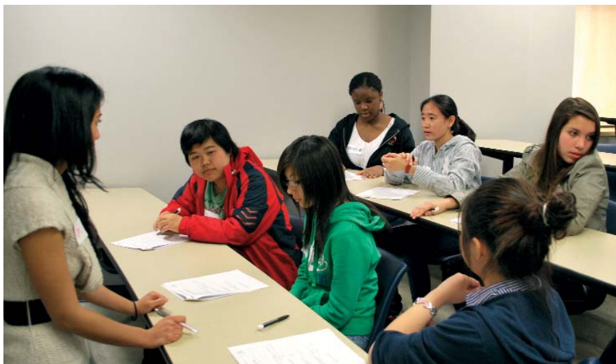
High School Students Participate in Active Citizens Workshop