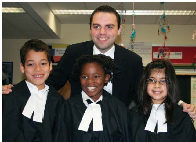
Elementary Civil Mock Trial Participants