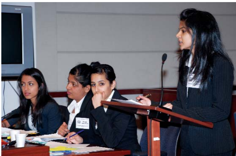
High School Students Argue a Case at the Peel Region Mock Trial Tournament