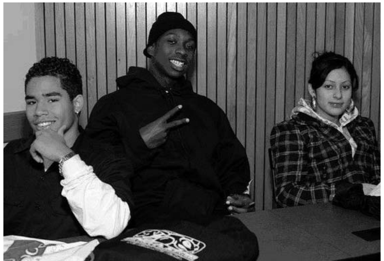
Students from Cardinal McGuigan Catholic Secondary School visit Osgoode Hall Law School.

The partner schools visit Osgoode Hall Law School once a term, and have a chance to meet law professors, tour the University and learn about law school life. In November 2007, Law and Civics students from both schools participated in full day events where they had the chance to speak with TOPSS mentors and university staff, and participate in mock trials.