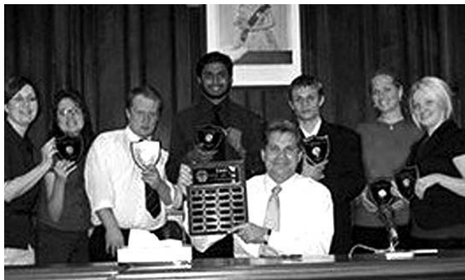
The Westlane Secondary School mock trial team poses after winning the regional competition.