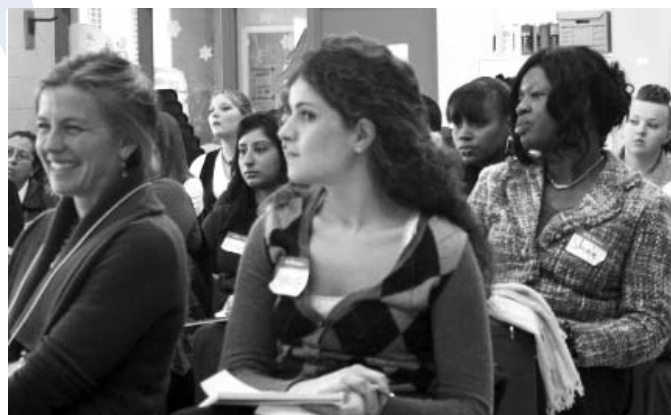
Community youth workers and Student Success teachers attend a Navigating the Justice System workshop.