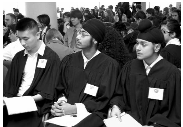
Students in Peel Region participate in a Mock Trial Tournament organized by the Peel Region OJEN Committee.

Mock trials are a staple justice education activity in some communities where there is longstanding participation of the bench and bar and a culture of friendly competition among local schools. In other cities, there are no mock trial events outside of the school. The LFO / OJEN Mock Trial Fund accepts applications from both established and new events and makes small grants to cover the cost of food, student transportation or logistical expenses. Over the three years of the fund, the number of competitions has grown, with Sarnia and Niagara introducing mock trial events into their communities. The Fund has also been able to reduce the operating expenses of some events by sharing good ideas generated in other cities. Most importantly, the fund has reduced or eliminated the cost to schools, ensuring that school or parental resources are not a prerequisite to student's opportunity to argue their first case before a judge. This year 16 mock trial competitions received grants from the fund and will share their photos, ideas and challenges with us so we can continue to improve this great learning opportunity.