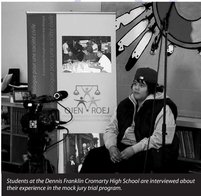
Students at the Dennis Franklin Cromarty High School are interviewed about their experience in the mock jury trial program.

With support from the local bar, students at the Dennis Franklin Cromarty High School's Civics/Careers class in Thunder Bay took part in a mock jury trial program.