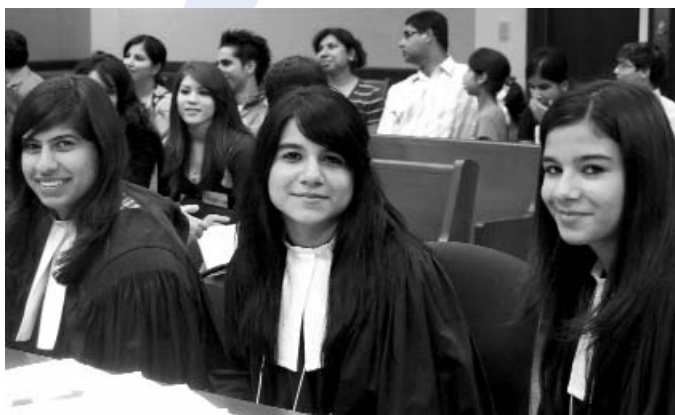
OJEN provides mock trial program for Ismaili Council of Ontario.

OJEN responded to an invitation from the Ismaili Council of Ontario to provide a Mock Trial program for a group of Afghan refugee youth in June 2010. Twenty girls and sixteen boys worked with lawyer coaches to prepare for a family mock trial and a mock bail hearing. The program culminated with youth staging their mock hearings for each other and their families at the Brampton Court House. The Council was referred to OJEN by the Afghan Women's Association who had participated in the Mock Trial program the year before. The experience fosters self-confidence and advocacy skills while at the same time helping the youth and their families develop confidence in Canada's system of rights protection.